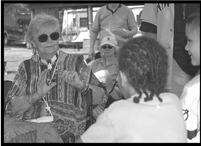
Grandmother Dawn told a wonderful collection of Native American stories that captivated young and old alike.

The festivities continued all afternoon until it was once again time to "Retire the Colors" announcing the end of the day and the end to a wonderful and fulfilling weekend.